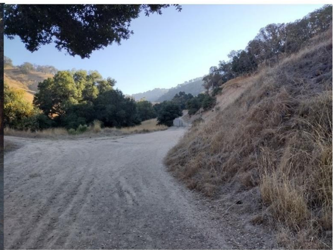
On Gravel up to the Dam