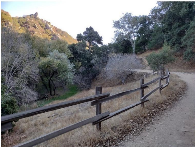
Rocks Getting Close